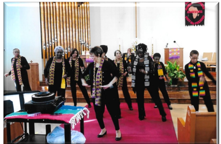
JOY (Just Older Youth) Senior Adult Ministry Zion Hill Baptist Church